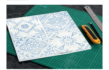
Tools for the job!