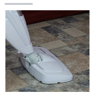
Vacuum cleaners are fine to use too! Caution - Take care with sharp objects!