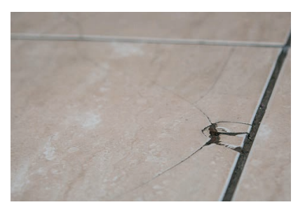
Fill any gaps or recessed grout lines to make the surface completely flat