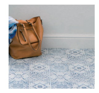
Allow 24 hours for the adhesive to bond