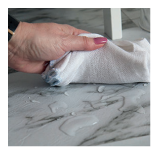
The vinyl floor tiles can be cleaned easily using normal household cleaners