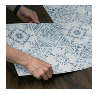
Butt join the tiles and stick to the floor