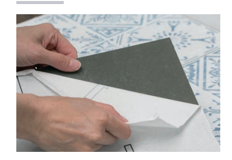
Peel away the backing paper