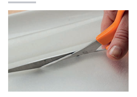
Cut the vinyl 2mm smaller than the window, this ensures the vinyl is not touching the edge or seal.