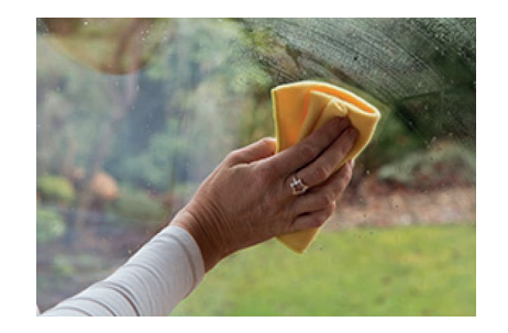
Clean glass thoroughly to remove dirt or dust.