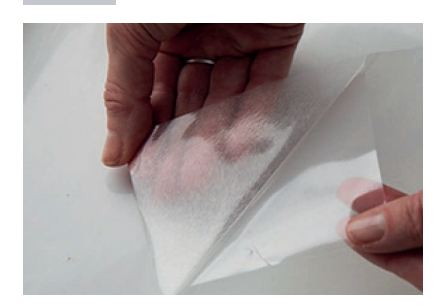
Peel away the backing paper.