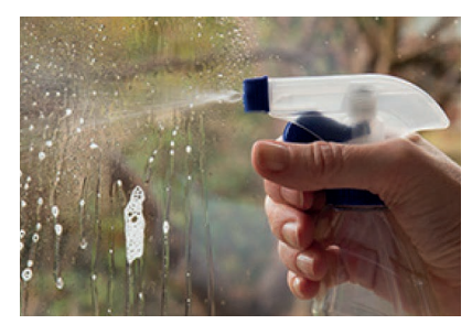
Spray the glass with water and a few drops of washing up liquid (not essential but can aid application)