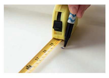
Use grid on backing paper to mark size.