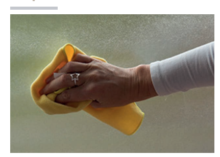
Dry surface with a cloth, leave to dry completely (the vinyl may go cloudy, this is normal and will dry clear in 1-2weeks)!