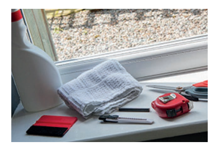
Tools for the job!